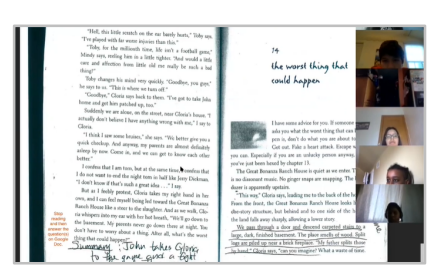
Three Ways to Cold Call