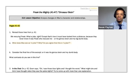
Modifying the Chat to Show Call