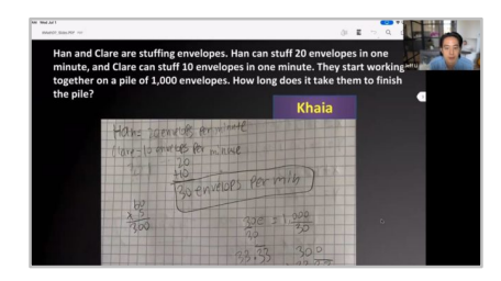
Set Up Tips to Support Show Call

And before jumping into the Show Call PD activities below, first make sure you've completed the Show Call modules (Show Call with Purpose; Positive Show Call; Analysis & Application.)