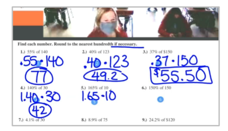
Using Cold Call to Create Community in Hybrid Classrooms

We recommend you complete the Cold Call modules (Introducing Cold Call, Positive Cold Call Culture, Unbundle & Follow-On) before completing the PD activities listed below: